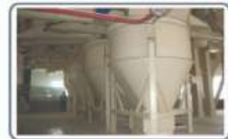
توريد وتركيب وتشطيب كل المعدات الداخلية للمصانع والمخازن والجمالونات Supply, installation and finishing of all interior equipment for factories and food additive