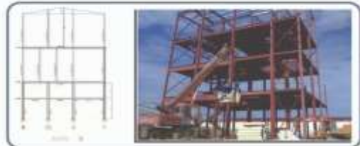
تصميم وتوريد وإشراف كل الهياكل المعدنية للمصانع والمخازن والجمالونات Design, implementation and supervision of all steel structures of the factories and the wards and trusses