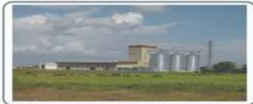
تسليم مفتاح للمصانع وتشطيب داخلي وخارجي ومرامد الشكل الجمالي Turnkey plants and finishing internal and external aesthetics and observe