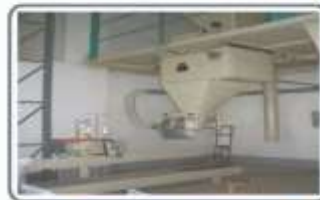
توريد وتركيب وتشطيب وتشغيل ماكينات الوزن والتعبئة Supply, installation and operation of finishing and weight machines and packaging