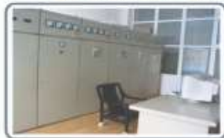
تجهيز وتشطيب غرف التحكم والمصانع للمصانع Processing and finishing control rooms of the factories